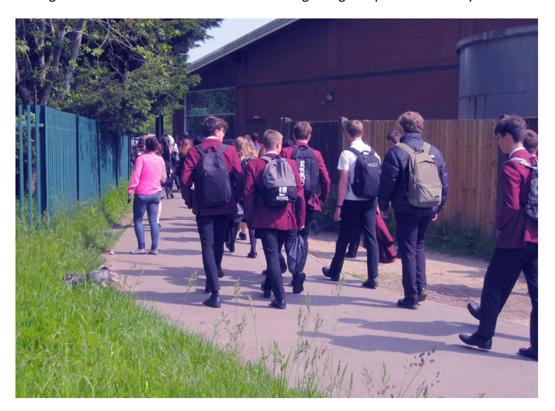
Figure 2: View of pedestrians on the shared footpath and cycleway, with the rear of the Tesco Store in the background. This photograph was taken on 18<sup>th</sup> May at about 15:30.