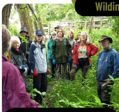
Balsam Pulling Goodyer Meadows