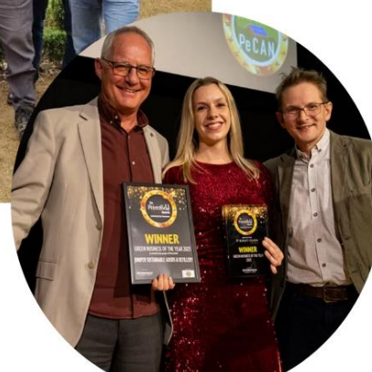
Awards winners 2025